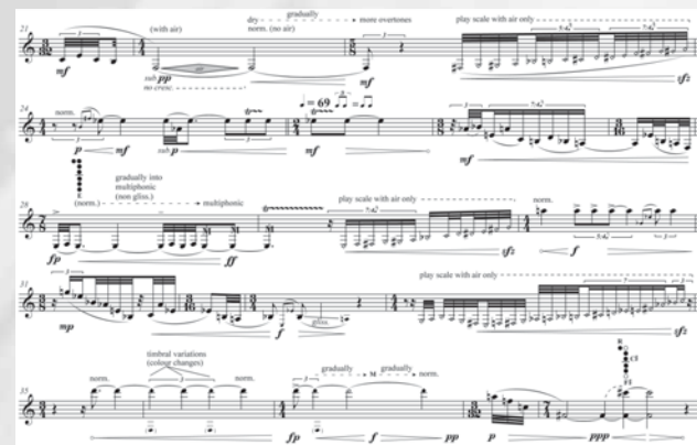
figure 71 (CD track 49). Antti Auvinen: Eliangelis

Workshop for composers and clarinetists Mikko Raasakka: Exploring the Clarinet - a guide to clarinet technique and Finnish clarinet music